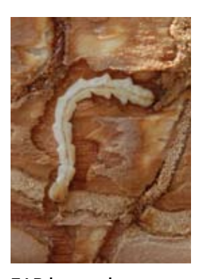
EAB larvae damage the vascular system of the tree as they feed, which interferes with movement of systemic insecticides in the tree.

In a discouraging study conducted in Michigan, ash trees continued to decline from one year to the next despite being treated in both years with either imidacloprid (Imicide®, Pointer<sup>TM</sup>) or Bidrin (Inject-A-Cide B<sup>®</sup>) trunk injections. Imicide®, Pointer™ and Inject-A-Cide B® trunk injections all suppressed EAB infestation levels in both years, with Imicide® generally providing best control under high pest pressure in both small (six-inch DBH) and larger (16-inch DBH) caliper trees. However, larval density increased in treated and untreated trees from one year to the next. Furthermore, canopy dieback increased by at least 67 percent in all treated trees (although this was substantially less than the amount of dieback observed in untreated trees). Although untreated trees were more severely impacted, these results indicate that even consecutive years of treatment with these trunk-injection treatments may only slow or delay ash decline when pest pressure is severe.