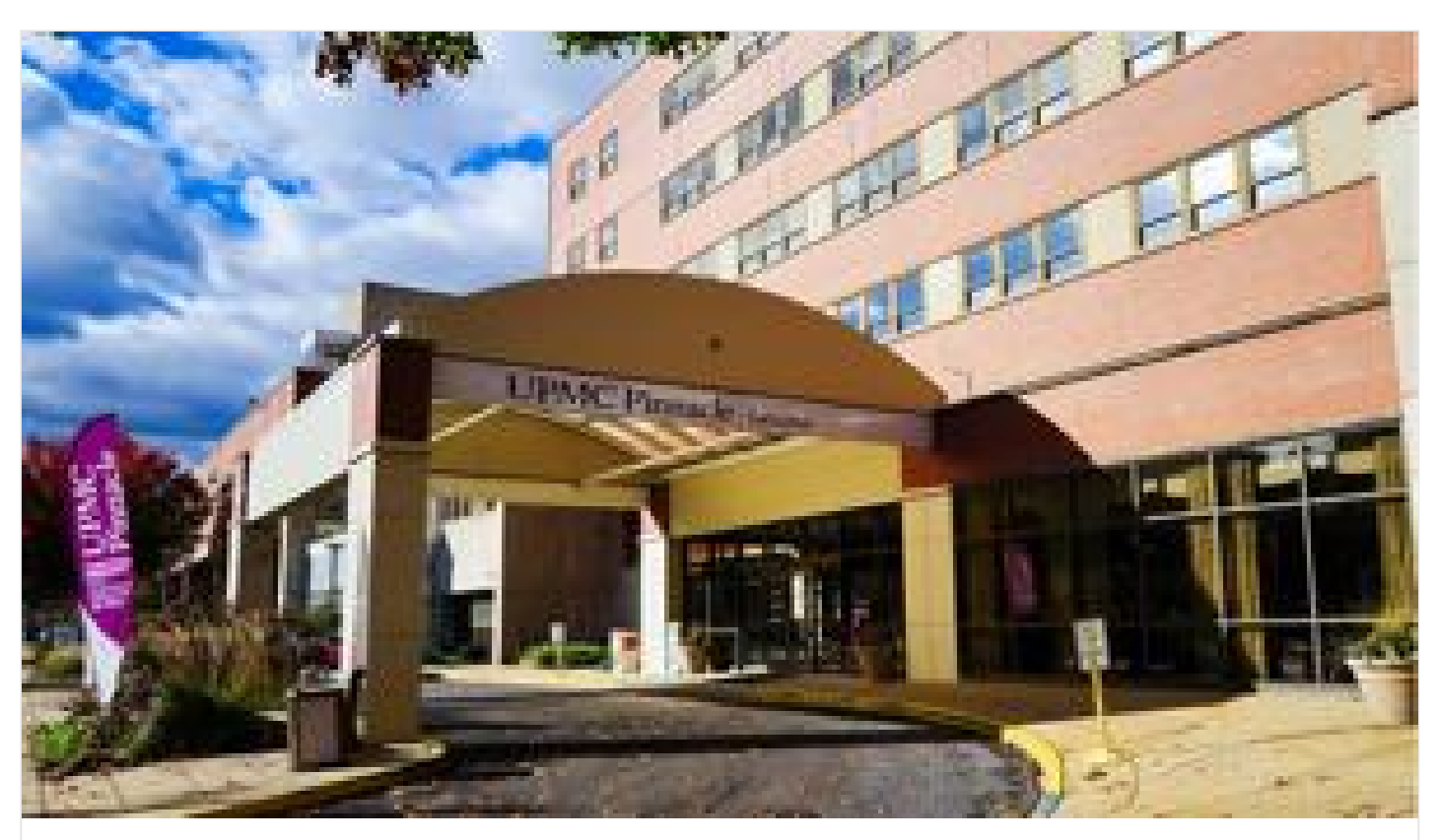
Complete coverage: UPMC Pinnacle Lancaster hospital closure