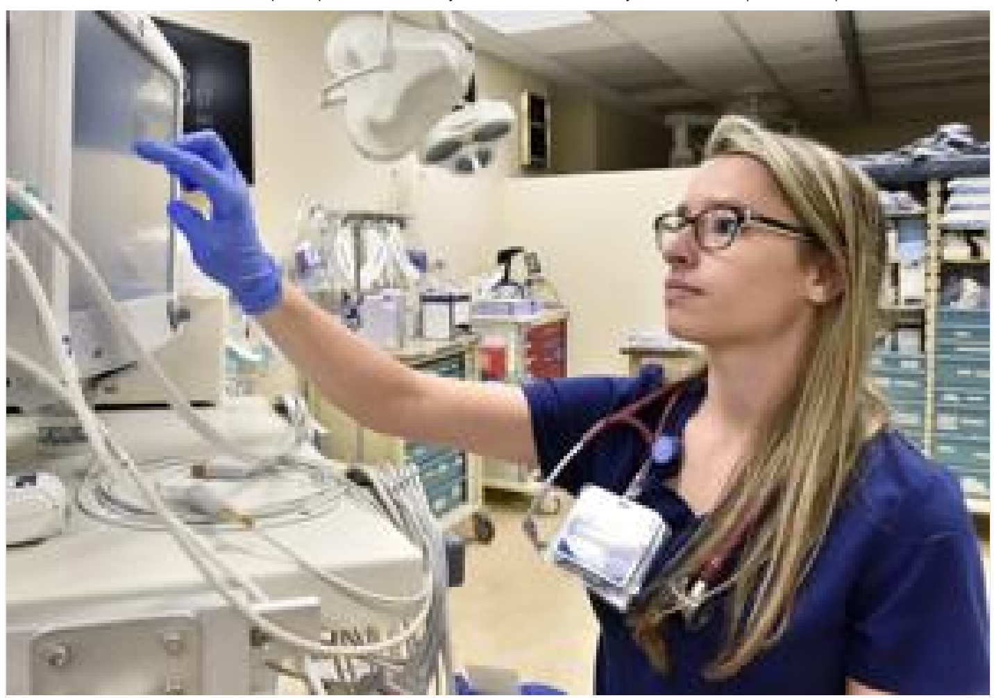
Lancaster General considers emergency department expansion beyond temporary modular