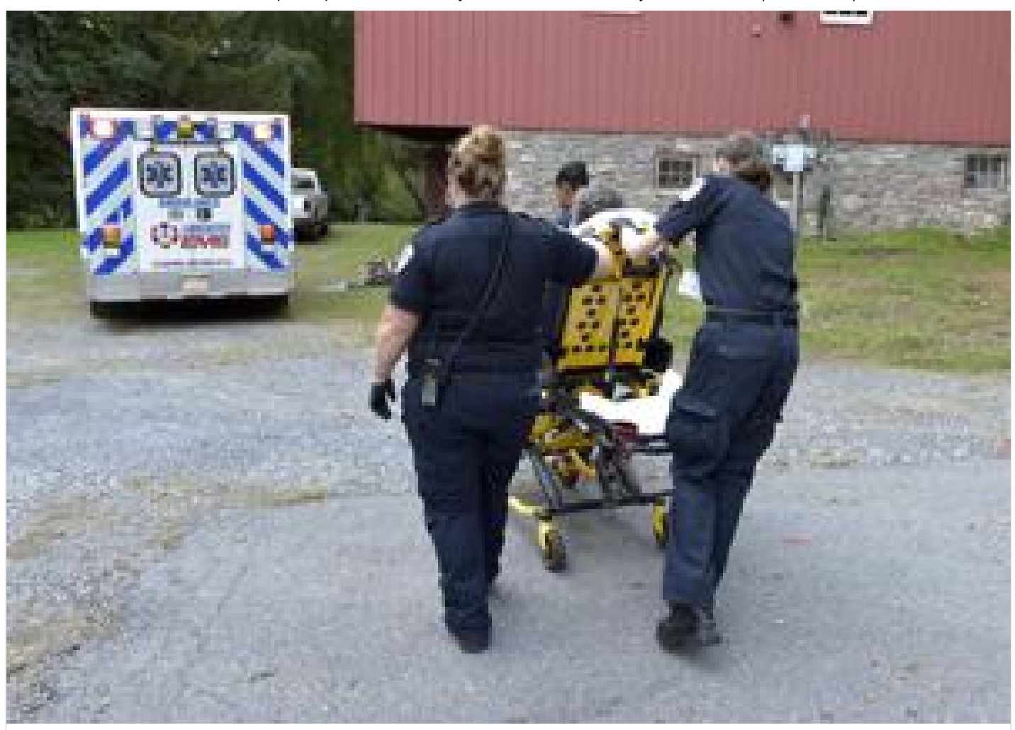
Lancaster EMS to move ambulance operations away from UPMC Pinnacle Lancaster campus