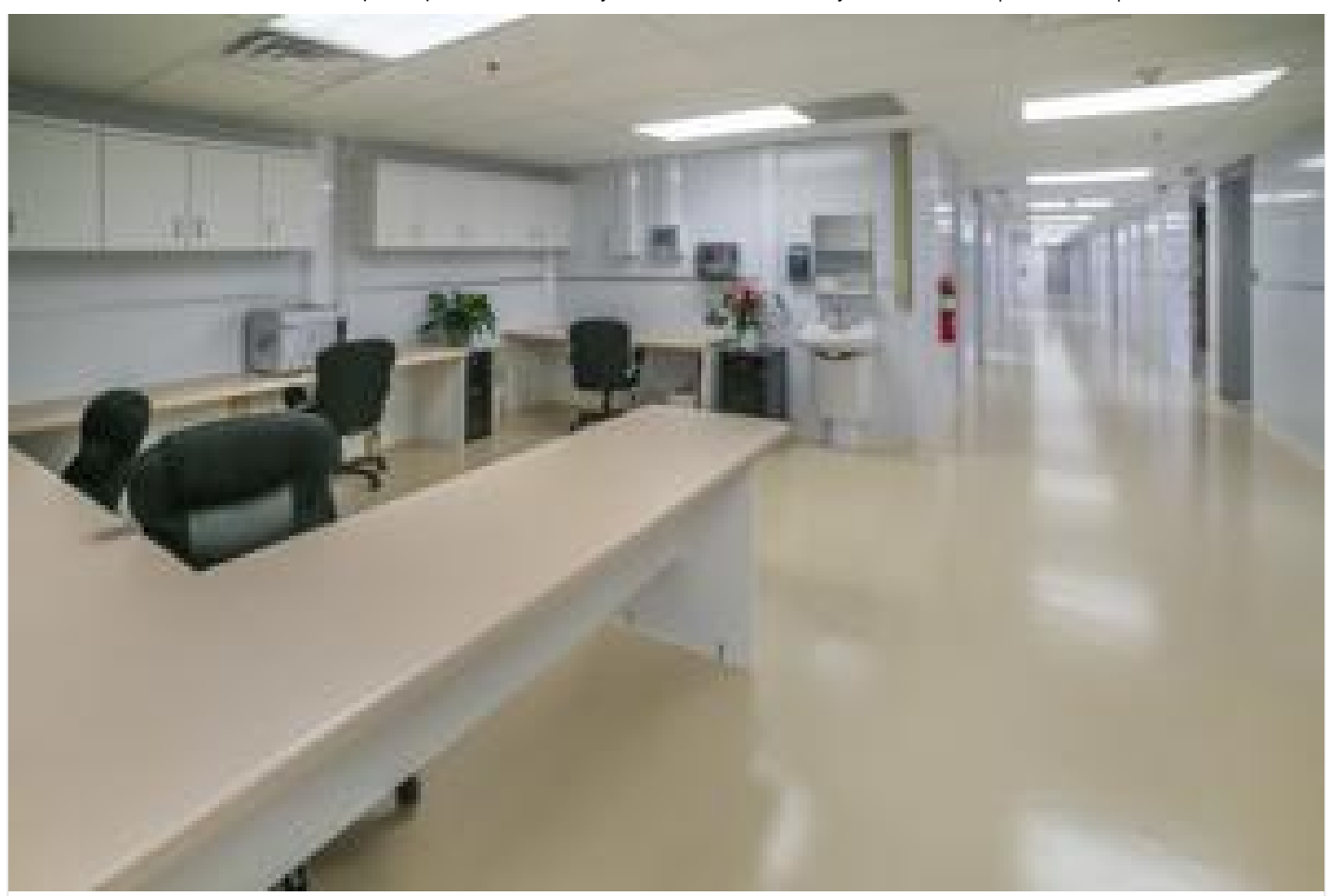
9-bay modular to expand Lancaster General Hospital emergency department capacity