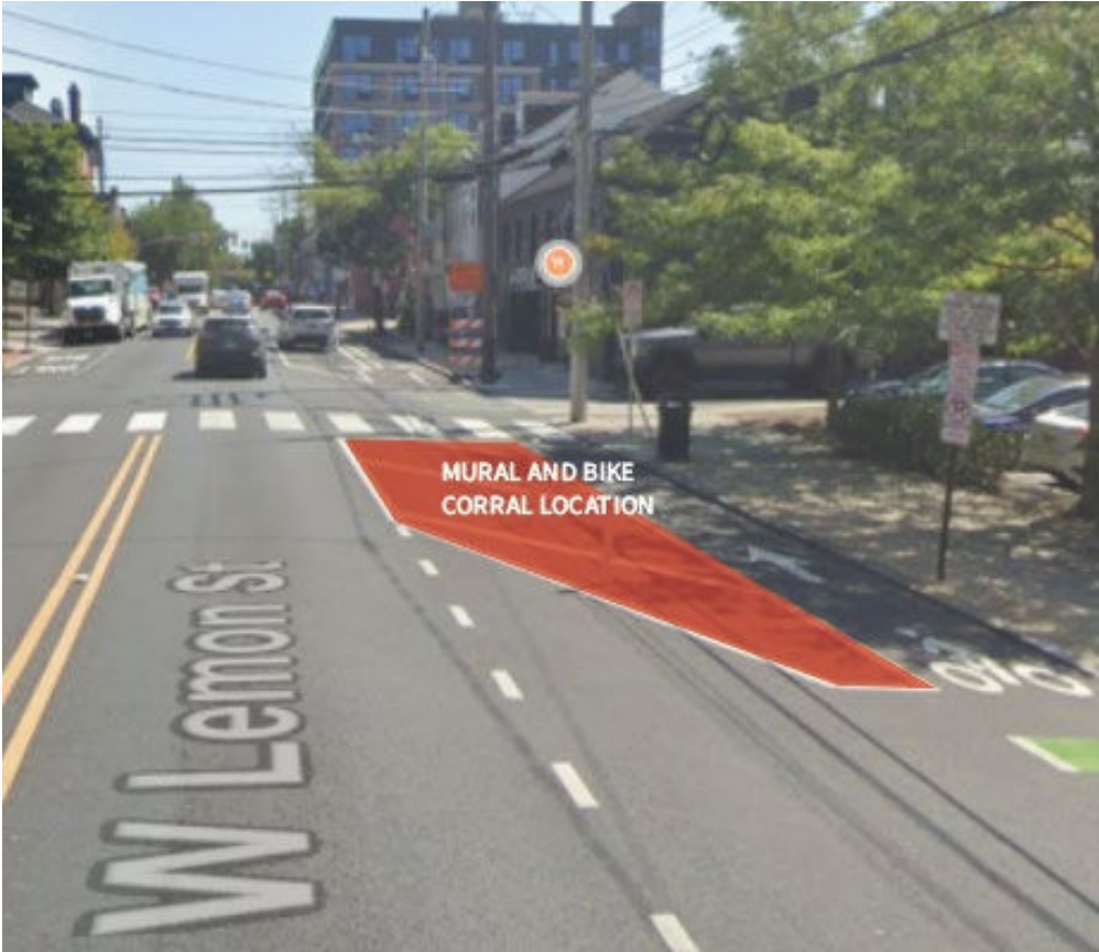
Mural and bike corral location on W Lemon St and N Market St